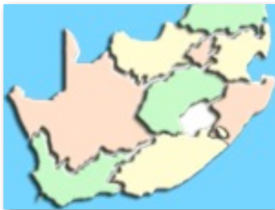
EVENTS HELD IN THE VARIOUS PROVINCES (P.3)