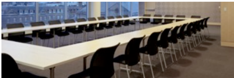
ANNUAL GENERAL CONFERENCE (P.7)