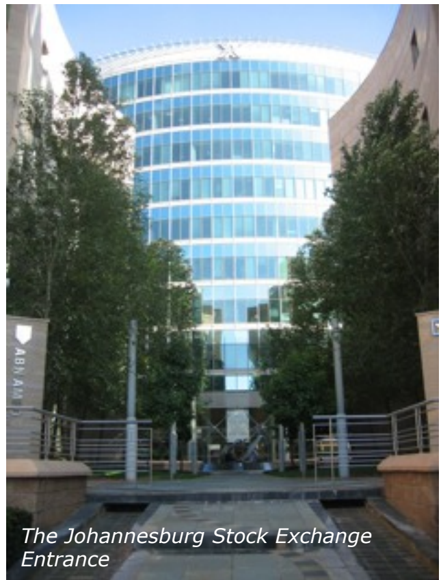
The Johannesburg Stock Exchange Entrance