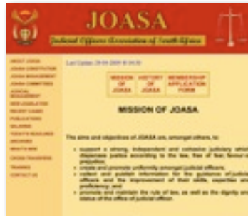
JOASA WEBSITE (P.2)