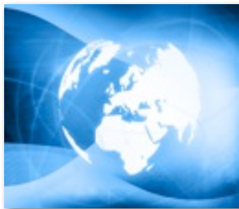
INTERNATIONAL CONFERENCES (P.10)