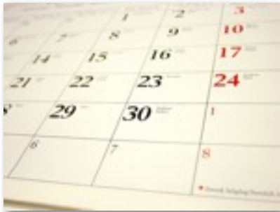
AGENDA OF EVENTS (P.2)