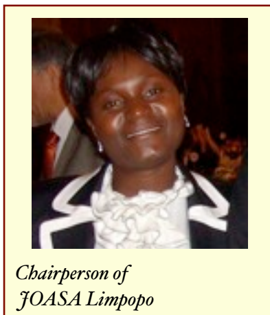
Chairperson of JOASA Limpopo

The Chairperson of the Limpopo province together with the pec of Limpopo organised a workshop concentrating on the "RECOGNITION OF CUSTOMARY MARRIAGES ACT 120 OF 1998". This was held on 4 April 2009 at the Vuwa Lodge in Polokwane.